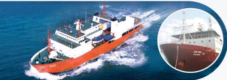
FORV SAGAR SAMPADA